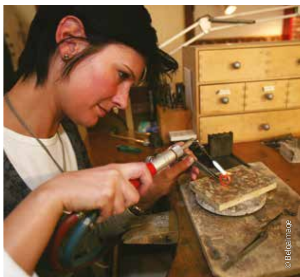
Goldsmith craft: the Youth Guarantee can lead to a traineeship with a goldsmith.

"I believe it has played a significant role in my rehabilitation. The fact that I've been forced to get out of the house several days a week to meet people, and practise my social skills, has been a vital part of the process."