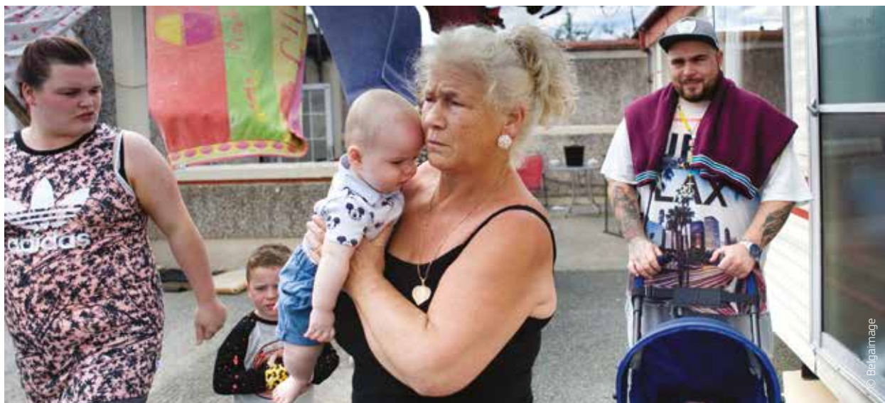
Poverty and inequality: Eurostat launched EU-wide statistics on income and living conditions, based on micro data collected from household samples, in 2003.