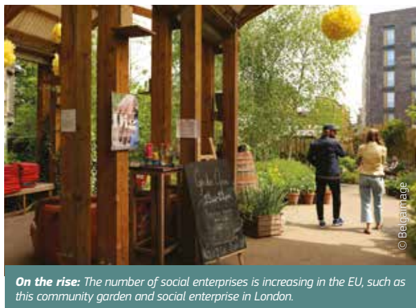
On the rise: The number of social enterprises is increasing in the EU, such as this community garden and social enterprise in London.

The number of social enterprises in Europe is increasing and they are engaging in new fields. Many countries are introducing new legislation as well as new support schemes to boost their development. Both public and private markets offer new opportunities for social enterprises to start up and grow, reveals a new report published by the European Commission. Both social economy and social enterprises have shown resilience and job retention during the economic crises and beyond. Because they respond to concrete societal needs and are often locally rooted, they are not exposed to speculative risks or job losses due to relocations.