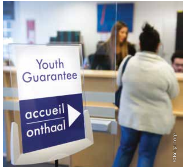
Activation: a push was given to traineeships proposed by public employment services, as part of active labour market policy measures.

Three major challenges are still facing EU countries, two years after the adoption of the QFT. Regulating open market traineeships is one of them. Filling the remaining gaps in traineeship regulation is another, especially as far as the lack of transparency, the duration and the recognition of traineeships are concerned – as well as learning content, in the case of open market traineeships. And a third challenge is to improve cooperation with social partners.