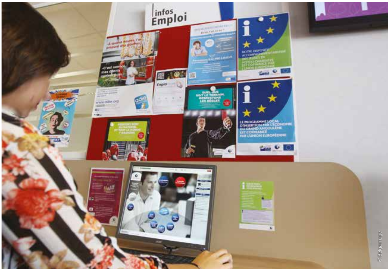
A driver for reform: the Youth Guarantee is helping public employment services consider youth as a specific group, in a customised pathway approach.

continued political commitment to the YG as a long-term, structural reform is required in order to effectively reap the benefits of the work carried out so far.