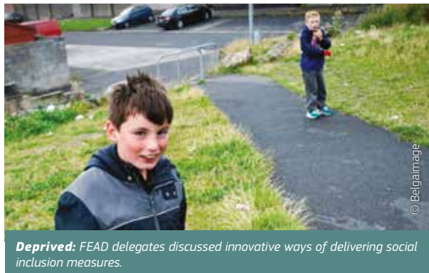
Deprived: FEAD delegates discussed innovative ways of delivering social inclusion measures.

The first two Fund for European Aid to the Most deprived (FEAD) Network meetings were held in Brussels on 26 September and 18 October 2016. The events allowed delegates to hear from projects and managing authorities in different countries and to discuss innovative ways of delivering accompanying and social inclusion measures. The first meeting focused on accompanying measures, the second one on the delivery of social inclusion measures (see p.24).