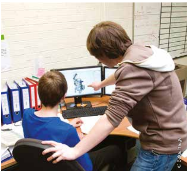
Promising start: 14 million young people have entered EU Youth Guarantee schemes since January 2014 and around 9 million took up an offer.

As far as apprenticeship systems are concerned, reflection is on-going on the creation of a Quality Framework for Apprenticeships. A European Alliance for Apprenticeships was launched in July 2013, bringing together governments with business, social partners, chambers, vocational education and training providers, regions, youth representatives and think tanks. It has mobilised so far 250 000 training and job opportunities.