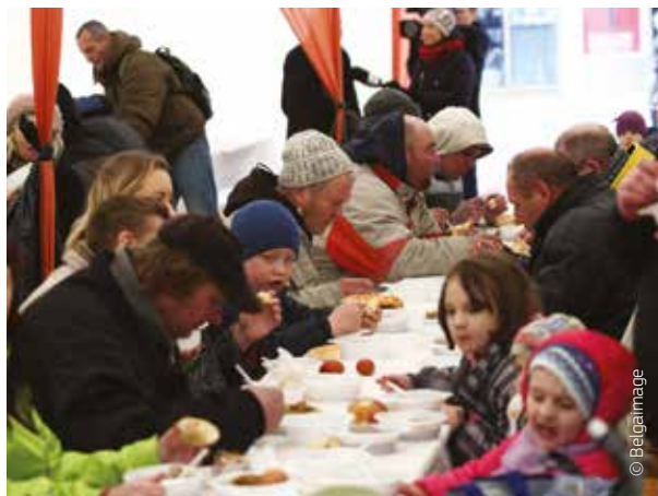
11 million beneficiaries: By the end of 2014, almost 11 million people had benefited from FEAD, according to EU countries' estimates.

For those countries that work in partnership with non-profit organisations, FEAD supports capacity-building within those organisations in the area of social policy, to make them better equipped to help the most deprived persons. In the majority of countries, assistance purchase is organised centrally, through procurement procedures, and the assistance itself is delivered and distributed by partner organisations.